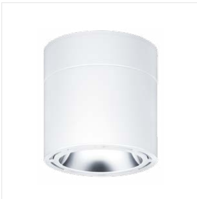
Chalice Pro HO

This high-output LED downlight is the ideal replacement for HID fittings in high-ceiling settings such as transport hubs and shopping centres.