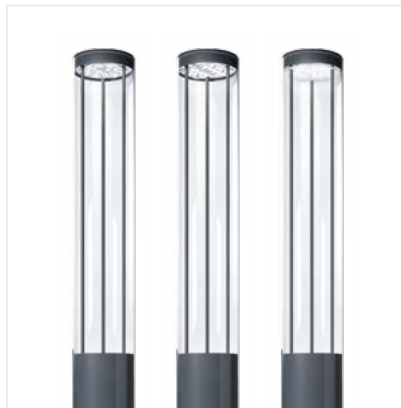
Alumet Control Direct

An elegant outdoor column boasting smart, long-lasting LED technology.