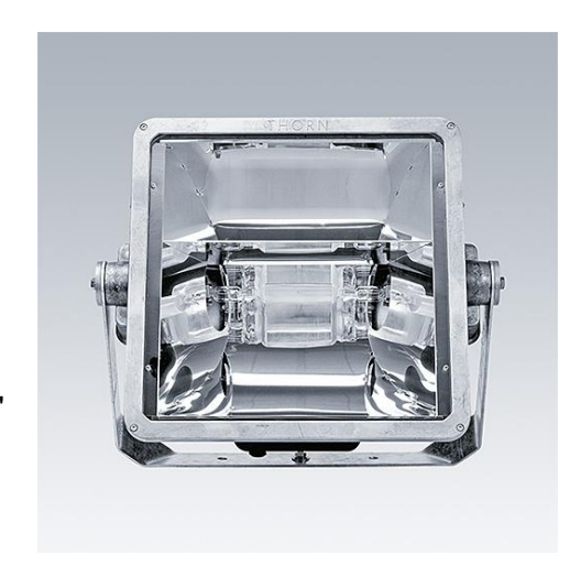
Photographs, line drawings and photometric data are representative only. For specific product detail please select an individual product.