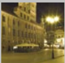
Toruń, Poland Highlighting a medieval past (page 3)

It's at 83 Great Portland Street - close to Oxford Circus - a great location providing a perfect spot for project meetings and customer events.