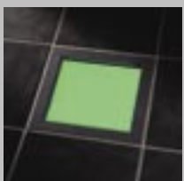
Band & Plane Creative illumination (page 4)