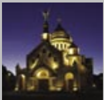
Sacred Heart Church Balata, Martinique Lighting to worship (page 3)