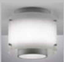
Garbo An enigmatic and all time classic (page 4)