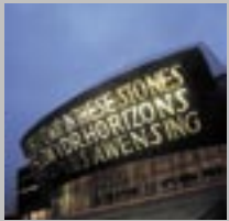
Millennium Centre, Cardiff Cultural enlightenment (page 2)