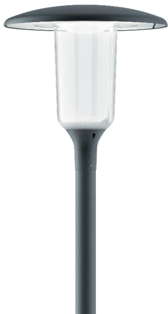
Aerie Slim Clear with comfort diffuser