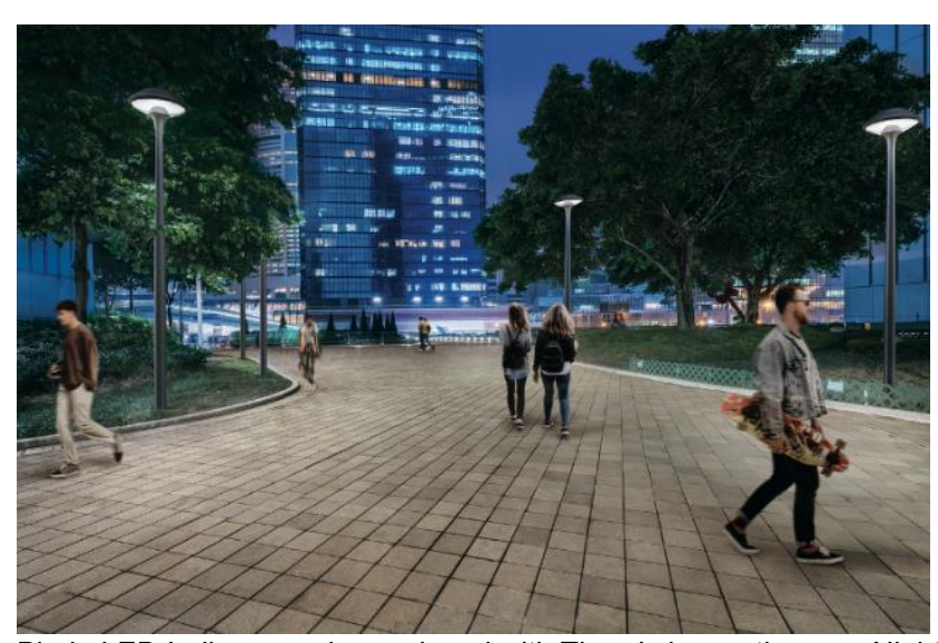
Plurio LED Indirect can be equipped with Thorn's innovative new NightTune technology, to adjust the lighting level and colour temperature to match the time of night and level of traffic

NightTune allows flexible adjustment of colour temperature and lighting level during the night