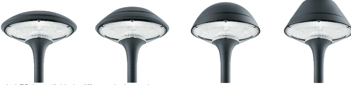
Plurio LED is available in different design variants