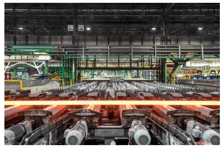
CRAFT from Zumtombel provides both uniform hall lighting and efficient illumination of the high-rack storage sections.