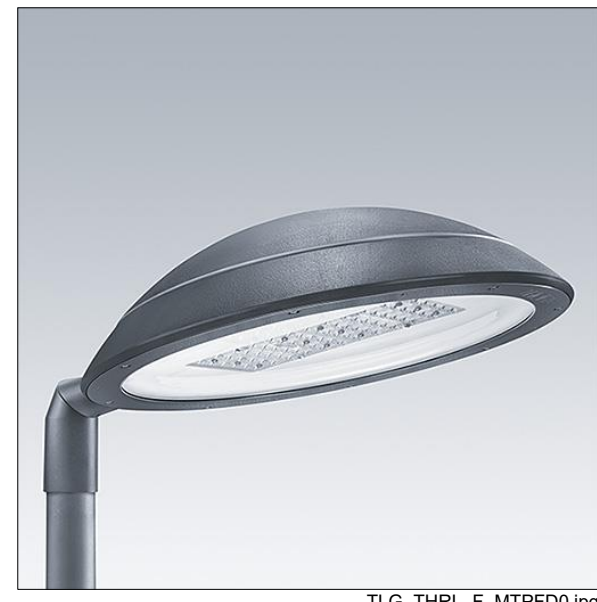
TLG THRL F MTPFD0.jpg

Weight: 14.8 kg Scx: 0.044 m<sup>2</sup>