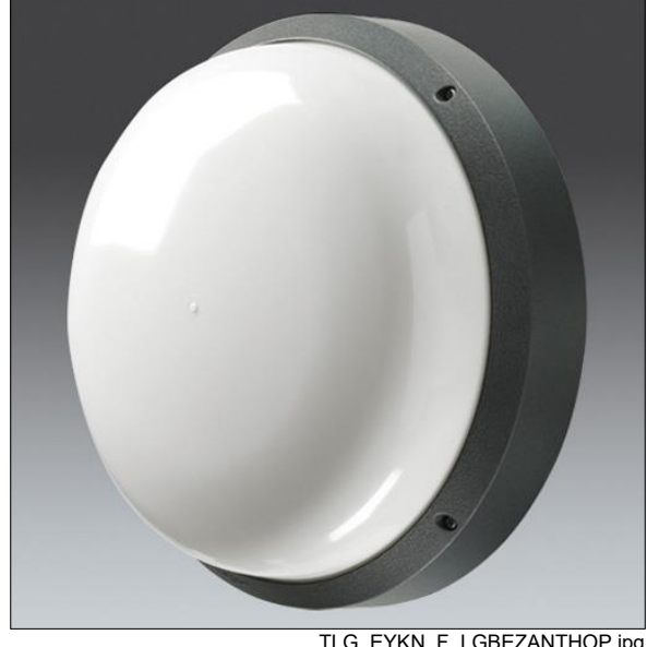
TLG EYKN F LGBEZANTHOP.jpg