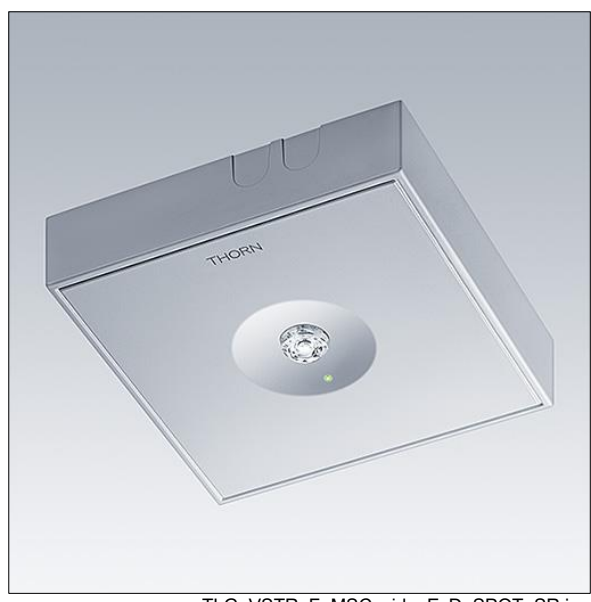
TLG VSTR F MSC side ExD SPOT SR.jpg