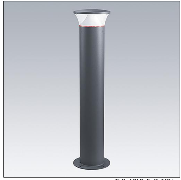
TLG ADLB F SLIMR.jpg