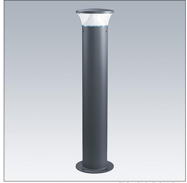
TLG ADLB F SLIMB.jpg