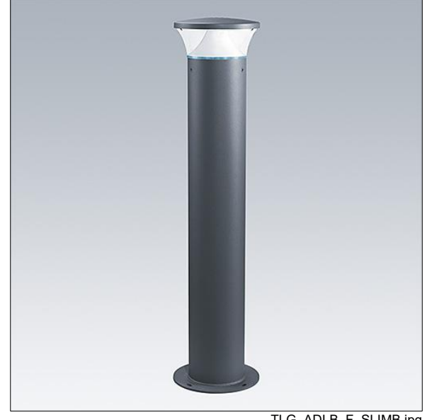
TLG ADLB F SLIMB.jpg