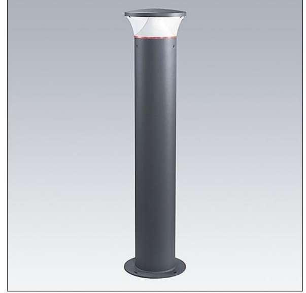
TLG ADLB F SLIMR.jpg