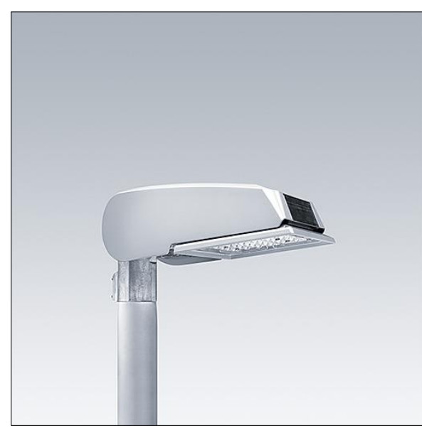
TLG CTEQ F SMTP36LEDPDB.jpg