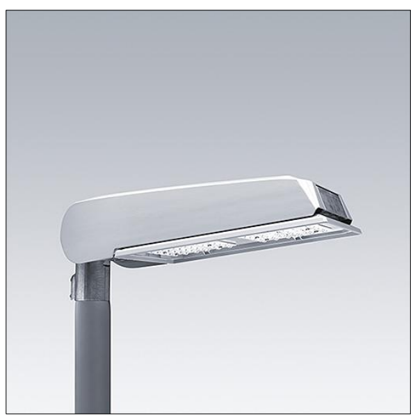
TLG CTEQ F LMTP72LEDPDB.jpg