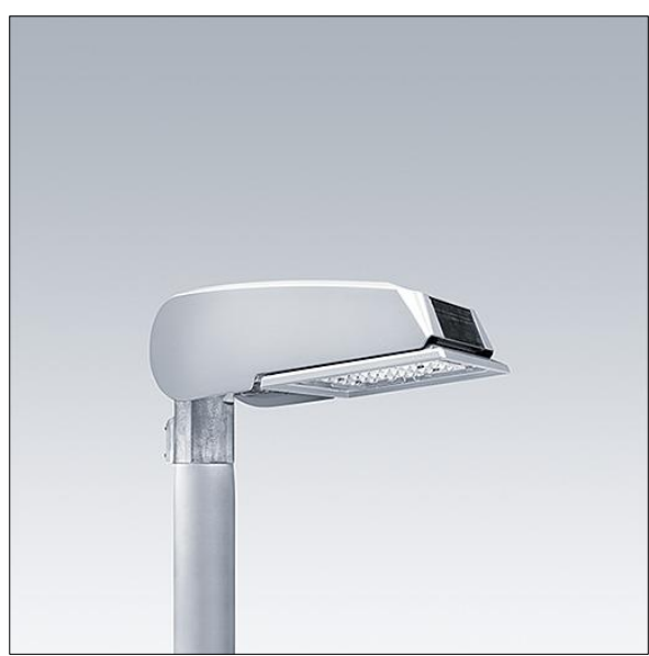
TLG CTEQ F SMTP36LEDPDB.jpg