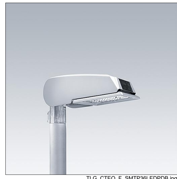
TLG CTEQ F SMTP36LEDPDB.jpg