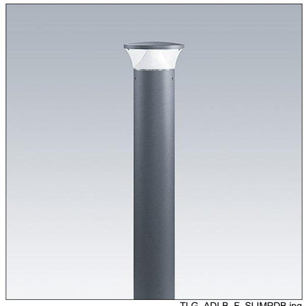
TLG ADLB F SLIMPDB.jpg