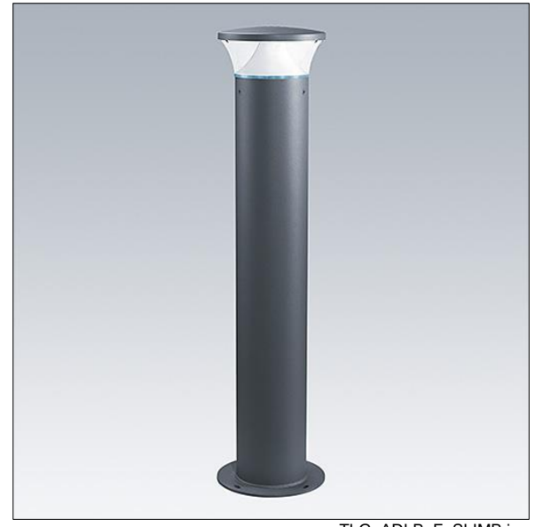
TLG ADLB F SLIMB.jpg