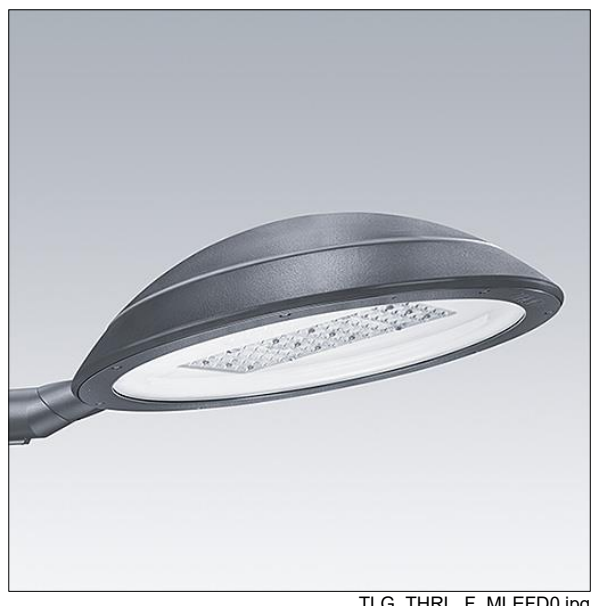
TLG THRL F MLEFD0.jpg

Weight: 14.8 kg Scx: 0.044 m<sup>2</sup>