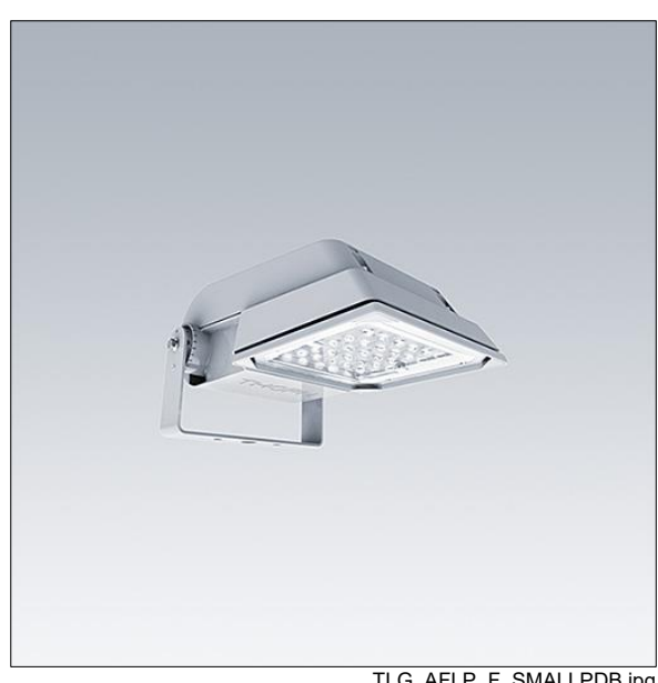
TLG AFLP F SMALLPDB.jpg