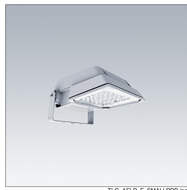
TLG AFLP F SMALLPDB.jpg