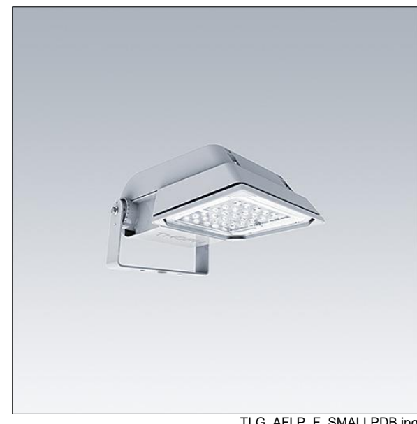
TLG AFLP F SMALLPDB.jpg