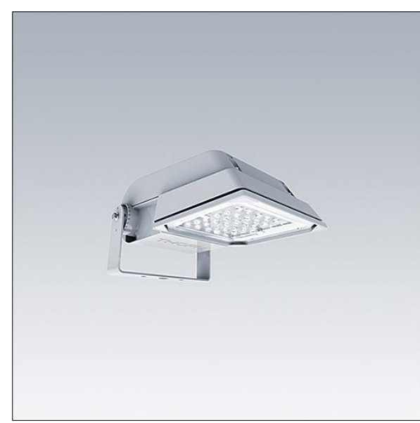
TLG AFLP F SMALLPDB.jpg