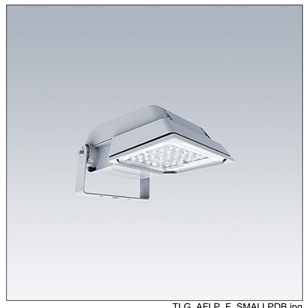
TLG AFLP F SMALLPDB.jpg