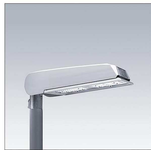
TLG CTEQ F LMTP72LEDPDB.jpg

Weight: 8.45 kg Scx: 0.115 m<sup>2</sup>