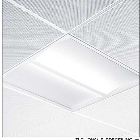
TLG IQWV F PDBCEILING.jpg