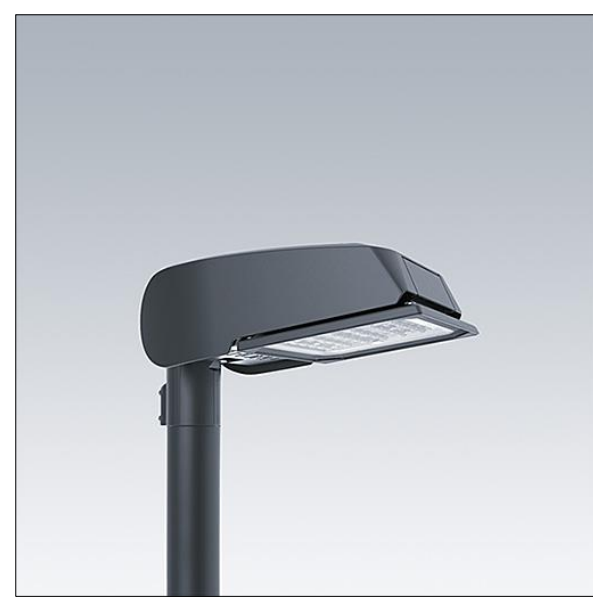
TLG CTEQ F SMTP60ANTPDB.jpg