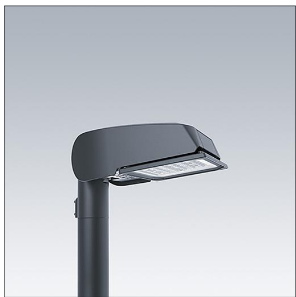
TLG CTEQ F SMTP76ANTPDB.jpg