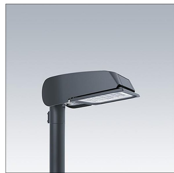
TLG CTEQ F SMTP60ANTPDB.jpg