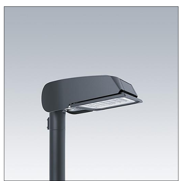
TLG CTEQ F SMTP60ANTPDB.jpg