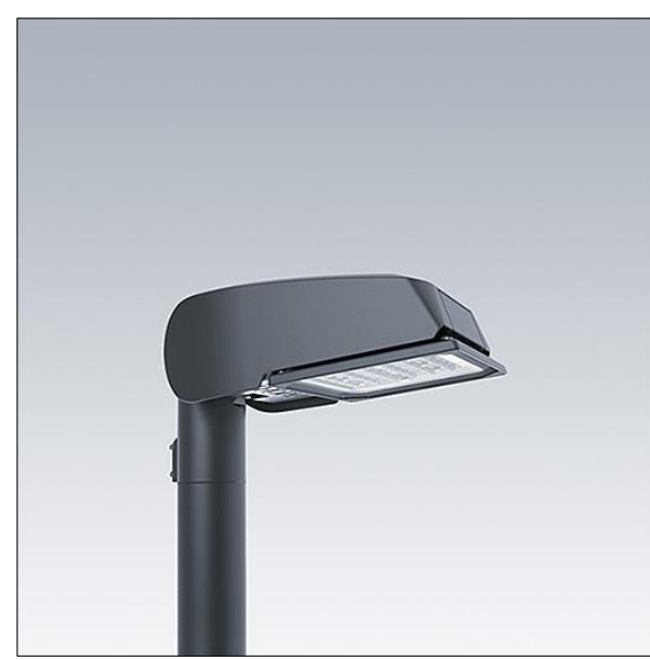
TLG CTEQ F SMTP76ANTPDB.jpg