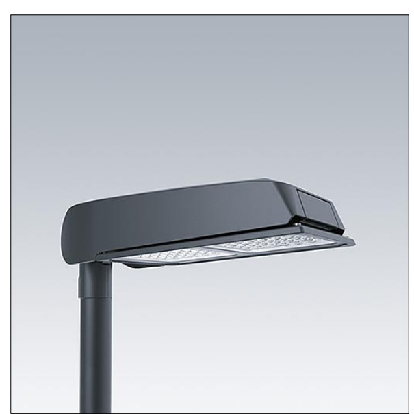
TLG CTEQ F LMTP60ANTPDB.jpg

Weight: 8.52 kg Scx: 0.115 m<sup>2</sup>