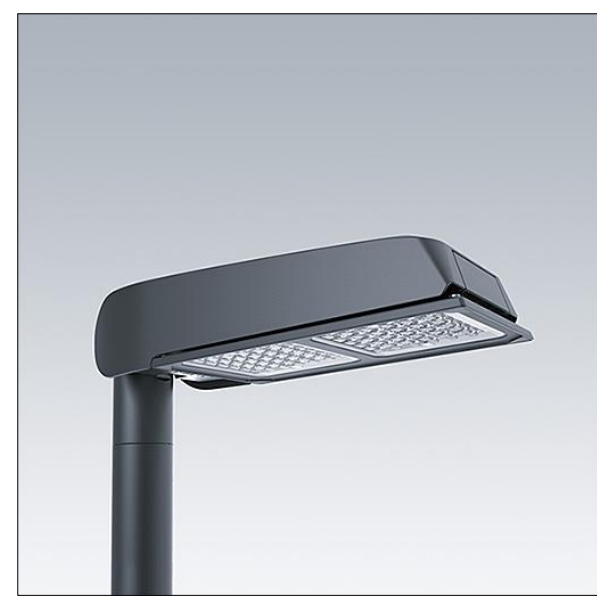
TLG CTEQ F LMTP76ANTPDB.jpg

Weight: 8.51 kg Scx: 0.115 m<sup>2</sup>