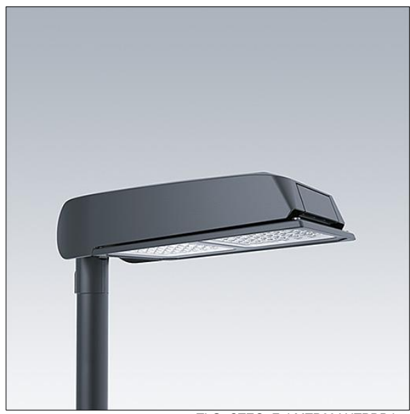
TLG CTEQ F LMTP60ANTPDB.jpg

Weight: 7.01 kg Scx: 0.115 m<sup>2</sup>