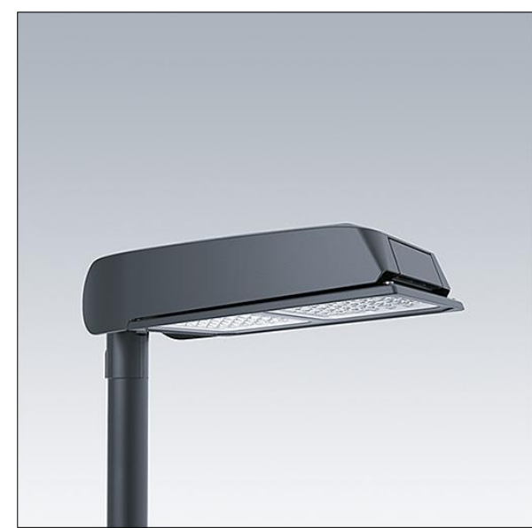
TLG CTEQ F LMTP60ANTPDB.jpg

Weight: 9.28 kg Scx: 0.115 m<sup>2</sup>