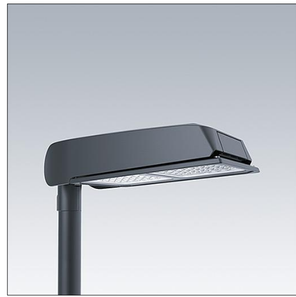
TLG CTEQ F LMTP60ANTPDB.jpg

Weight: 9.26 kg Scx: 0.115 m<sup>2</sup>