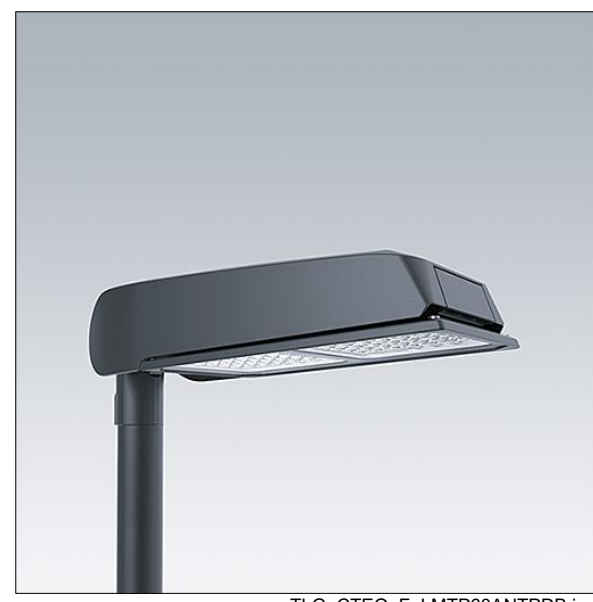
TLG CTEQ F LMTP60ANTPDB.jpg

Weight: 9.26 kg Scx: 0.115 m<sup>2</sup>