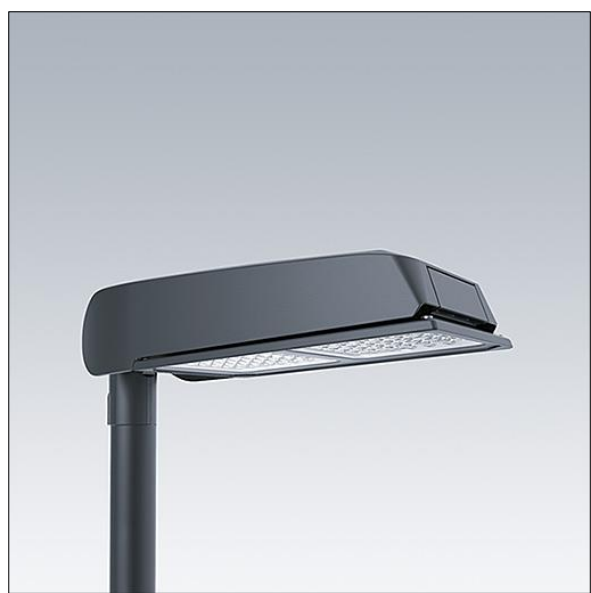
TLG CTEQ F LMTP60ANTPDB.jpg

Weight: 9.26 kg Scx: 0.115 m<sup>2</sup>