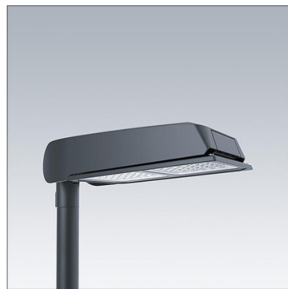
TLG CTEQ F LMTP60ANTPDB.jpg

Weight: 10.03 kg Scx: 0.115 m<sup>2</sup>