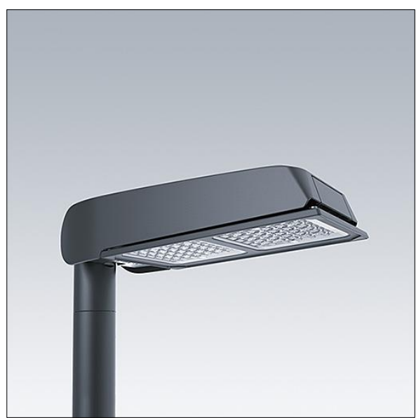
TLG CTEQ F LMTP76ANTPDB.jpg

Weight: 10.09 kg Scx: 0.115 m<sup>2</sup>