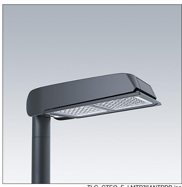
TLG CTEQ F LMTP76ANTPDB.jpg

Weight: 10.09 kg Scx: 0.115 m<sup>2</sup>