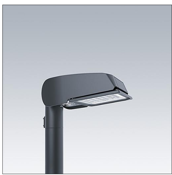
TLG CTEQ F SMTP76ANTPDB.jpg