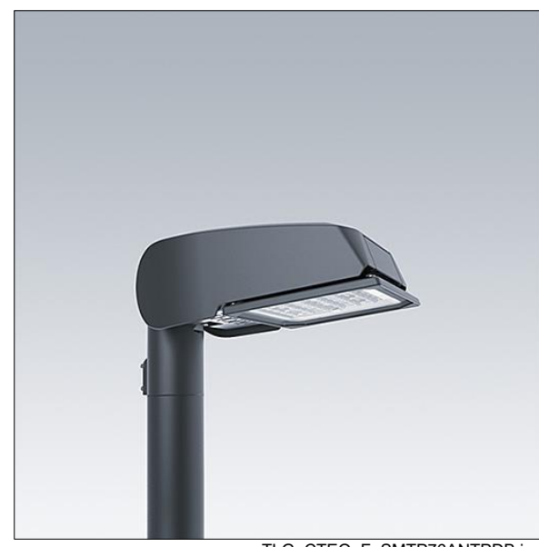
TLG CTEQ F SMTP76ANTPDB.jpg