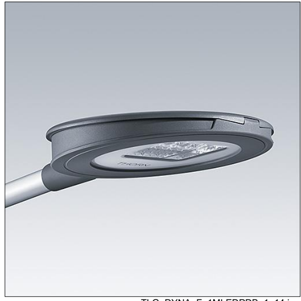
TLG DYNA F 1MLEDPDB 1 14.jpg

Weight: 10.84 kg Scx: 0.03 m<sup>2</sup>