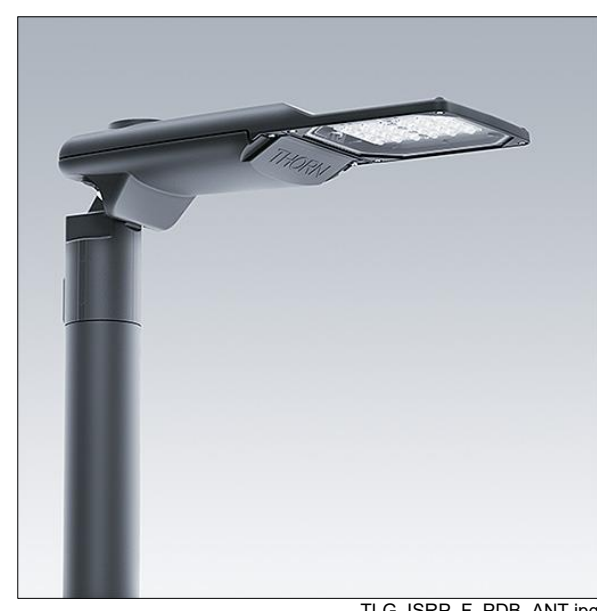
TLG ISRP F PDB ANT.jpg