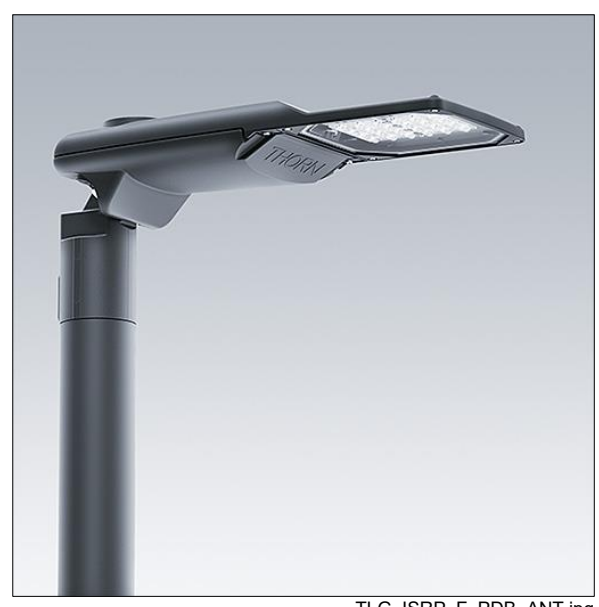
TLG ISRP F PDB ANT.jpg