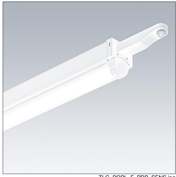
TLG POPL F PDB SENS.jpg