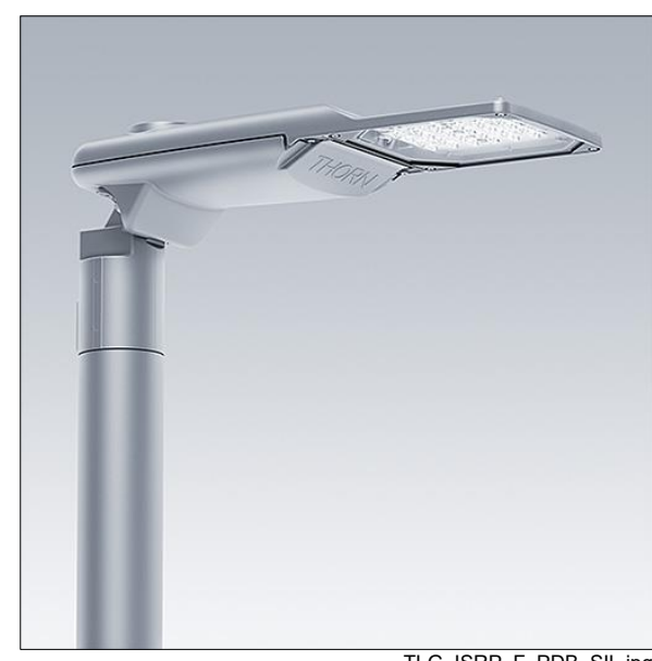
TLG ISRP F PDB SIL.jpg