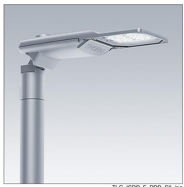
TLG ISRP F PDB SIL.jpg